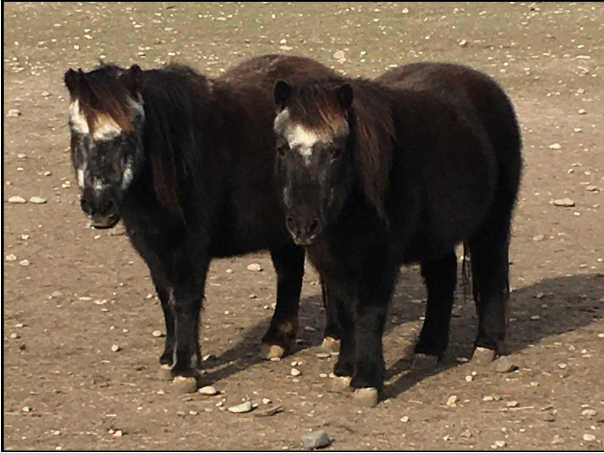
Sugar and Coco

Sugar and Coco are sweet mini-horses who were relinquished to Wings last year after their owner passed away. They are in good health but were overdue on dental floats and hoof care. Both need extra handling as it takes extra effort to catch them. Sugar is much more skittish than Coco, so several volunteers have been working on haltering them regularly.